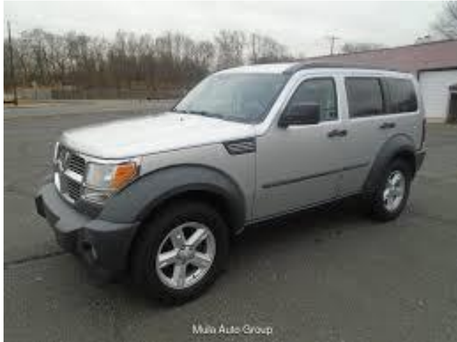
2007 Dodge Nitro –

***NOTE that the attached photo is NOT the actual vehicle involved in this incident - it is a similar model / type ***